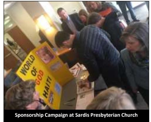
Sponsorship Campaign at Sardis Presbyterian Church

We are celebrating 26 children sponsored on April 10 by the members of Sardis Presbyterian Church today! This represents a 47% increase in students sponsored from Sardis!!!