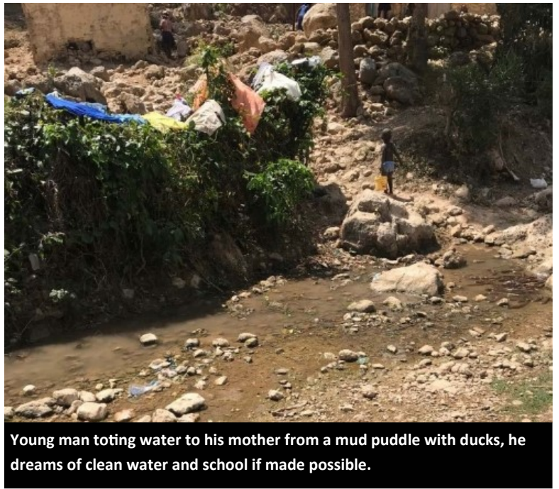
Young man toting water to his mother from a mud puddle with ducks, he dreams of clean water and school if made possible.